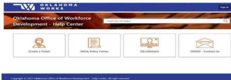
OOWD Helpdesk Screen